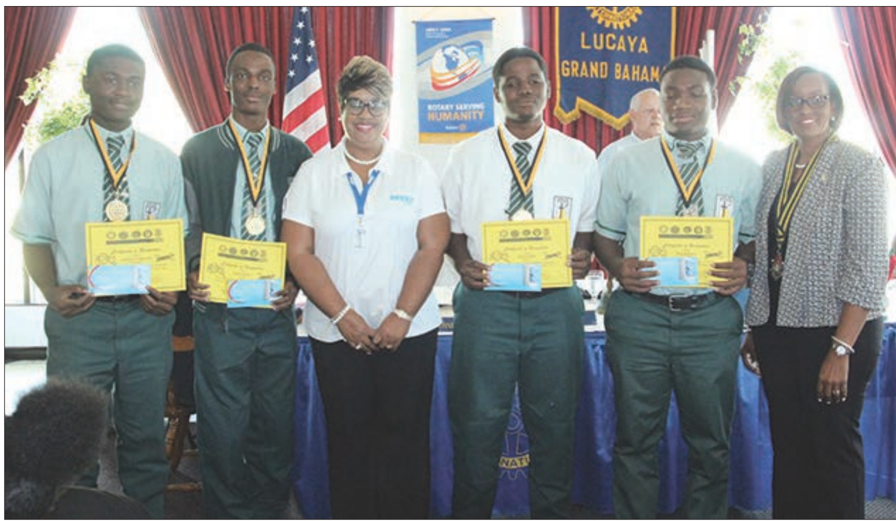
SUNLAND BAPTIST ACADEMY TEAM.