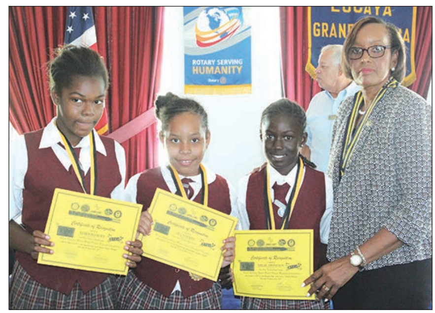
FREEPORT PRIMARY TEAM.