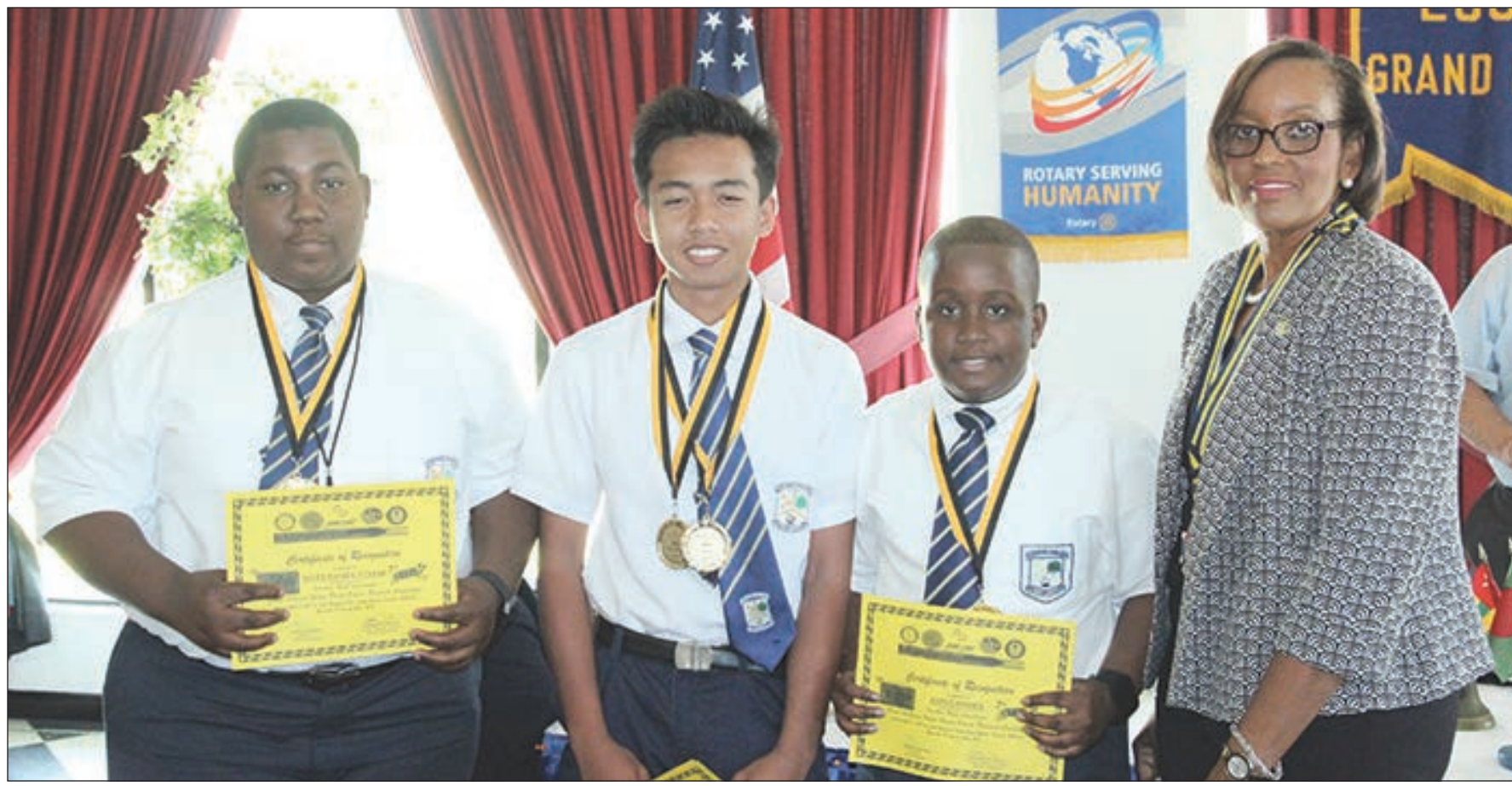
BISHOP MICHAEL ELDON SCHOOL.