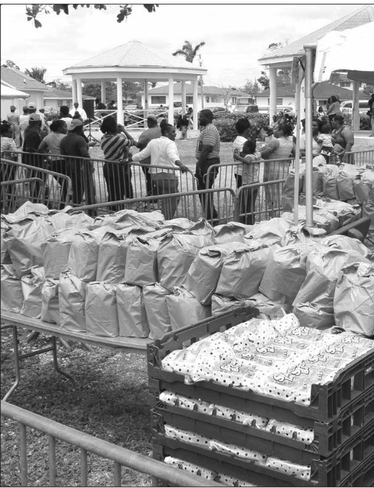
Care packages are shown ready for distribution.