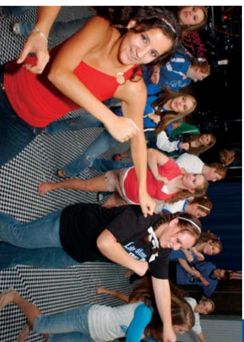
Above: Students dancing to Soulja Boy at the homecoming dance after Friday's football game.