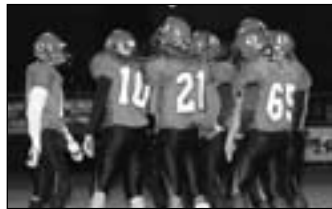
Just posted OHS FB vs. St. Thomas Aquinas

Browse and purchase photos and photo keepsakes from recent local sporting events at: http://ottawaherald.mycapture.com/mycapture/index.asp