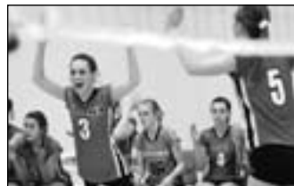
Recently posted OHS VB vs. Basehor-Linwood