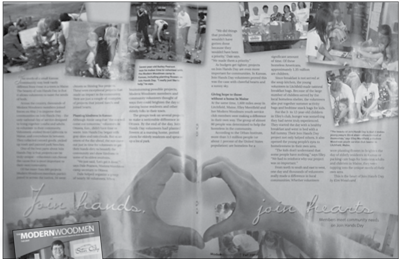
Images from The Modern Woodmen

History and people will follow geography.