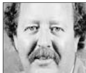
At the Rail