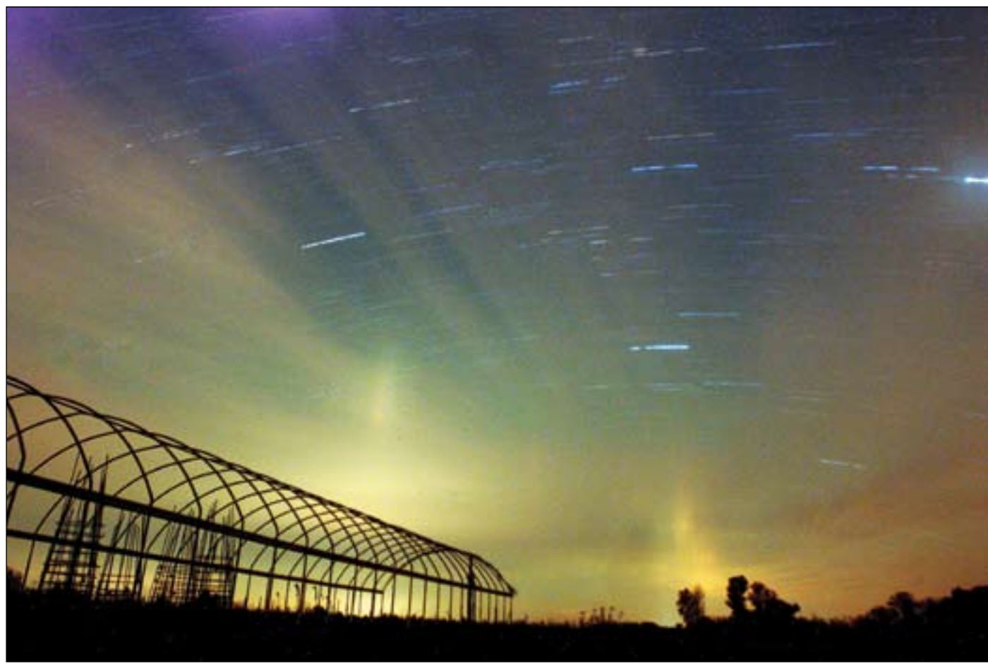
Above: A starscape dominates the horizon last month on a farm in rural Franklin County in this photo with an exposure time of nearly 20 minutes. Even in such an isolated location, light pollution from Ottawa and surrounding towns remains prevalent on the horizon.