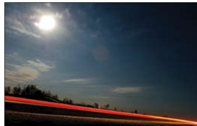
Above: Taillights of a passing car can be seen in this long exposure photo taken Tuesday on U.S. 59 near Ellis Road, south of Princeton.

MORE PHOTOS OF 'OTTAWA AFTER DARK,' PAGE 11