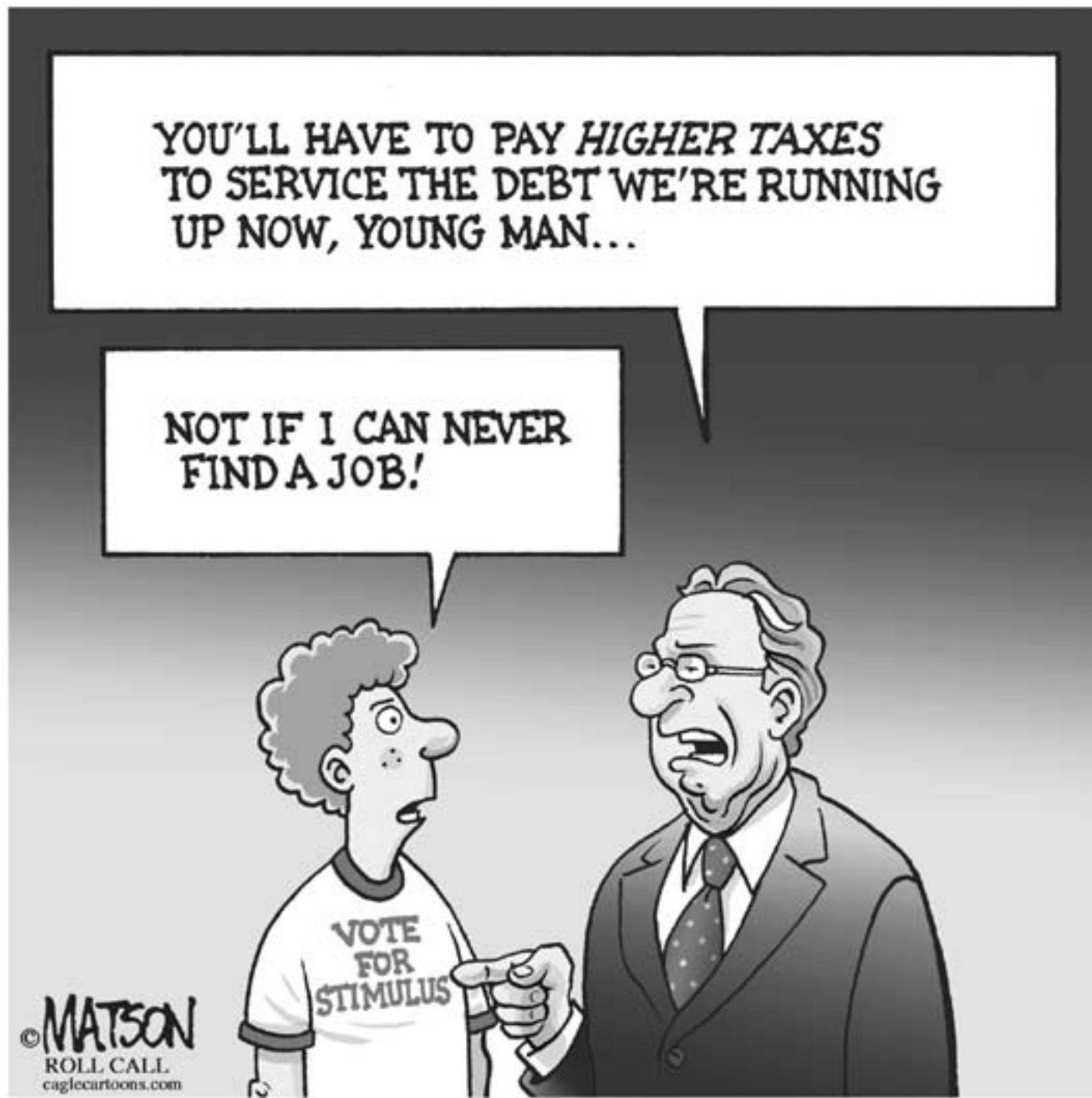
ONLINE EXCLUSIVE: More editorial cartoons at http://www.ottawaherald.com/news_opEdToons/

Postmaster: Send address changes to The Ottawa Herald, 104 S. Cedar, Ottawa, KS 66067 (785) 242-4700 (800) 467-8383