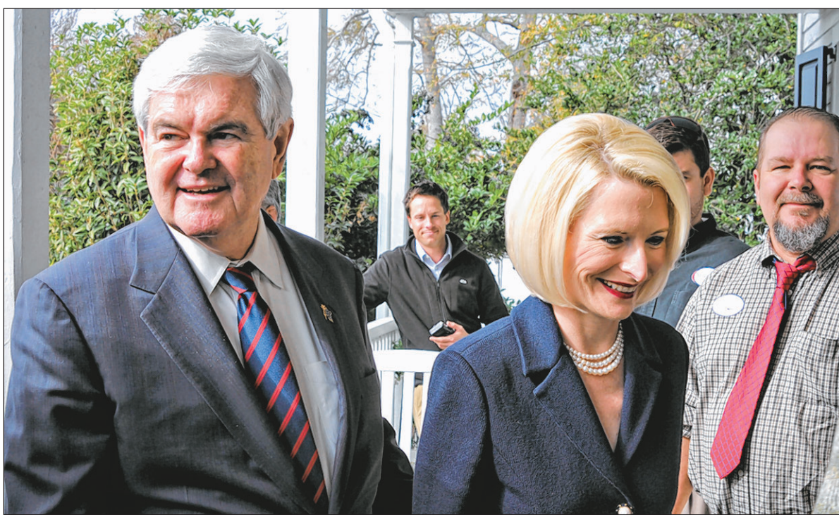
Republican Presidential candidate Newt Gingrich arrives at Summer House on West Luke Street in Historic Downtown Summerville with his wife Callista.